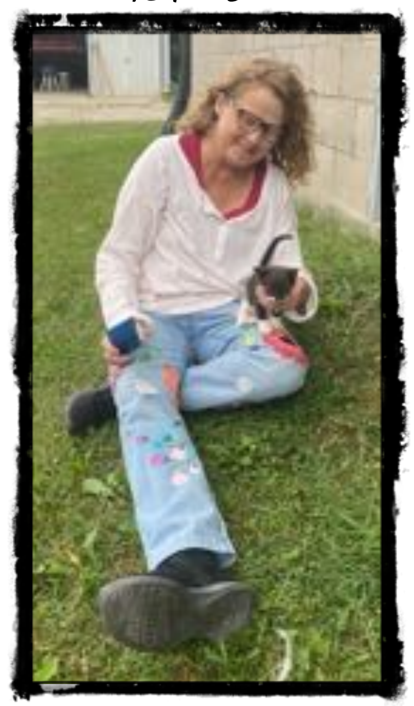
Sunflower Memorial Service Saturday, October 15, 2022